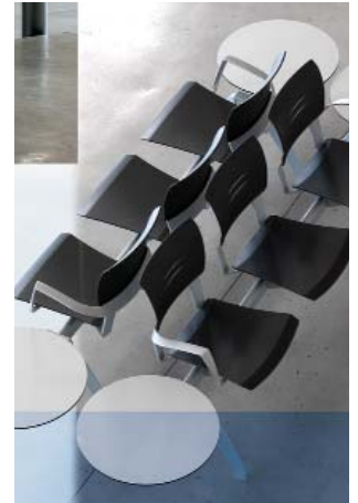
Tandem seating with 3 seats and tables on the ends.

The metal bench parts are painted with powder epoxy paint. Minimum thickness: 60 microns.