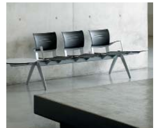
Tandem seating with 3 seats and tables on the ends.